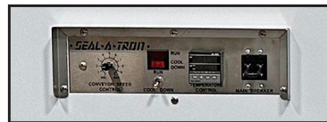
Standard Digital Temp Controls